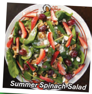
Summer Spinach Salad