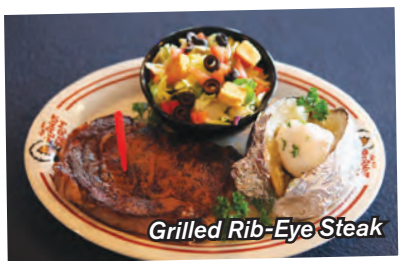
Grilled Rib-Eye Steak

One full pound hand cut with just a touch of tex-mex flavor. $30