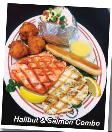
Halibut & Salmon Combo

A fillet of each, the best Alaska has to offer. $29