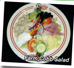
Farm Cobb Salad

Chicken, Reindeer, Cheddar, and Provolone. $14.50