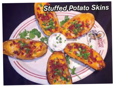
Stuffed Potato Skins

Five spuds deep fried and topped with Cheddar, bacon bits and chives. Served with sour cream. $15.25