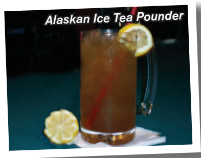
Alaskan Ice Tea Pounder

A 25 oz. powerhouse proudly made with Tito's, Bacardi, Tanqueray, José Cuervo, Triple Sec Liqueur, Sweet and Sour and Coca-Cola. *Limit two (2) per customer. $16 Add strawberries $1