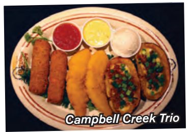
Campbell Creek Trio

Potato skins, Mozzarella sticks, and Chicken strips. $15.25 (No substitutions.)