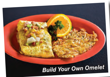
Build Your Own Omelet

Choose 3 for $13. (Each additional $1.50.)